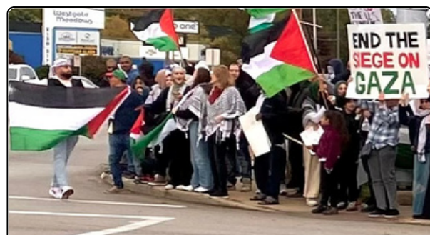
Local Community Members Protest Siege on Gaza

October was filled with many events, in school and worldwide. Some of these worldwide events significantly impacted the TIA Student body. The beginning of October had come as a shock to us, as we witnessed the events of October 7th and the following military onslaught against Gaza. Many of TIA's students have family and friends who were, and continuously are, impacted by the current conditions in Gaza. Social media coverage of the atrocities happening has affected all of us both at school and with our families at home. It was hard to turn a corner in the school without hearing students speaking about their hurt and concern over the injustice of collective punishment. Feeling helpless in the face of the images of suffering coming out of Gaza, many students gathered to discuss how to voice their opinions - through boycotts, protests, and spreading awareness.