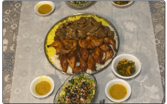
TRADITIONAL IRAQI DISH

Kleicha is made of a very soft doughy that you can stuff with dates, coconuts, sesame seeds, and other sweet fillings. Once filled, you can make fun shapes out of the dough and top it with a sauce made from eggs, coffee, and apple cider vinegar. Cooked in the oven, this dish is so delicious! The Iraqis tend to make this dessert on Eid.