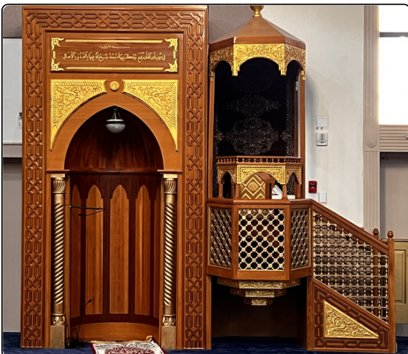
THE MINBAR OF MASJID SAAD