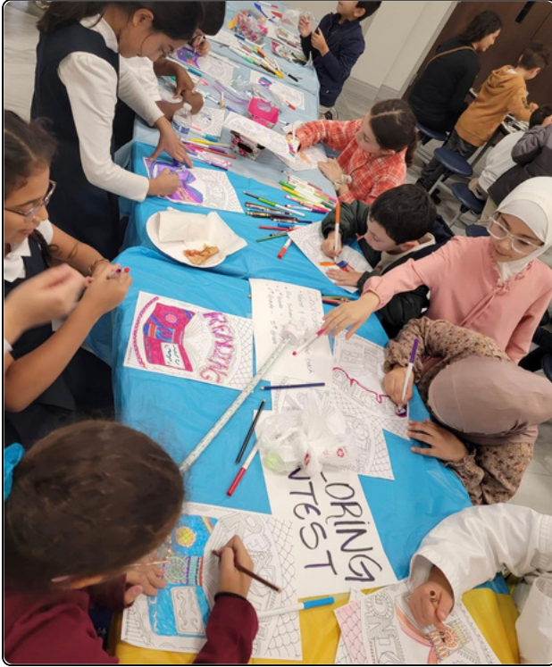
TOP: STUDENT ACTIVITIES DURING LITERACY NIGHT BOTTOM : PTO HOSTED ANNUAL BOOKFAIR