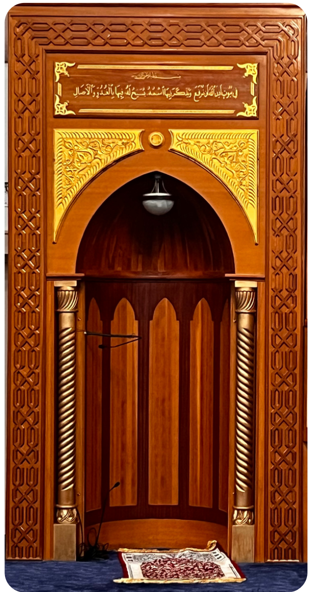
THE MIHRAB OF MASJID SAAD

Praying Tahajjud is a great opportunity for the believer to directly communicate with Allah, seek forgiveness, and have their needs fulfilled. Trust that Allah grants what is best for you during the blessed time of Tahajjud, and do not pass up this daily opportunity. Inshallah, we will all take advantage of this blessed time.