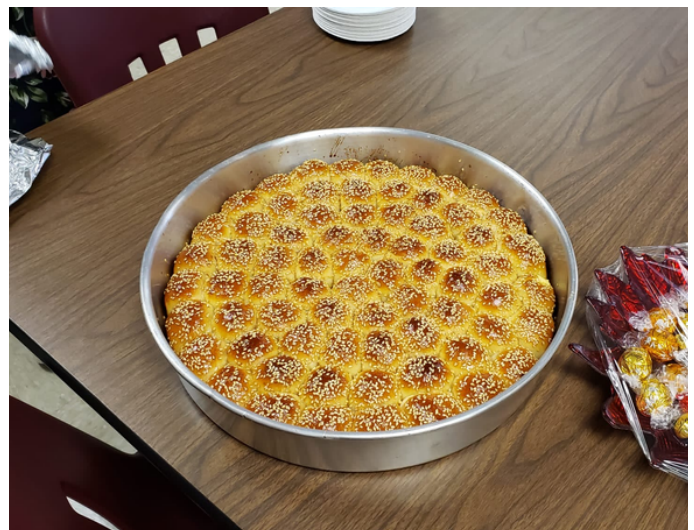
TRADITIONAL IRAQI DISH

Iraq is a place of deep cultural roots and it's vibrant cultural history can be seen in the Iraqi sense of community, our delicious cuisine, and our open invitations into our homes.