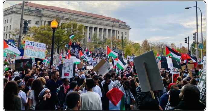
On Saturday, November 4, 2023, people from all across the country flocked to Washington, DC to demand an immediate Ceasefire.

Reports from inside Gaza have indicated that surgeries are being performed without anesthesia and doctors are using vinegar as a disinfectant. With dwindling access to fuel and electricity, newborn babies in incubators - and the tens of thousands injured - are at high risk as medical equipment will begin failing.