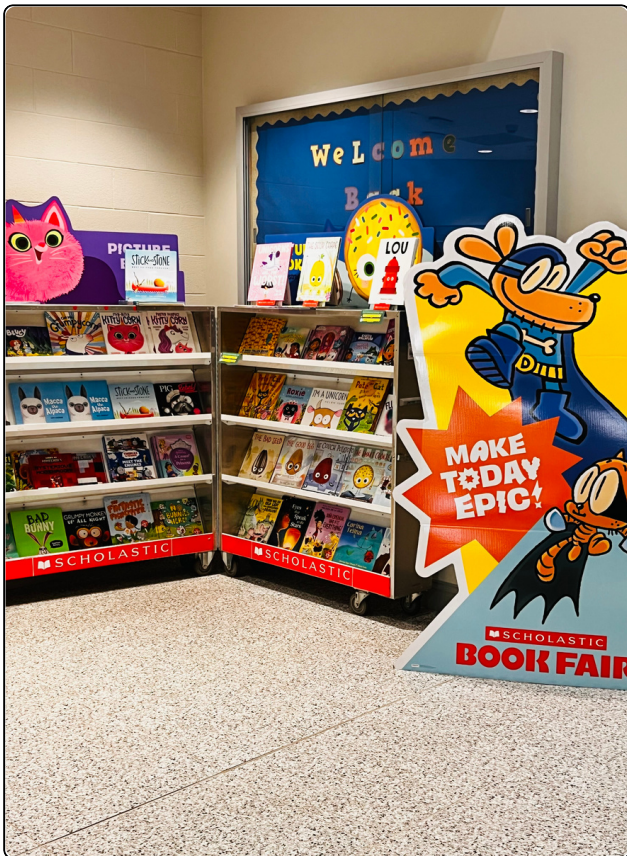
TIA.s Annual Book Fair

In local news, the PSAT's were held on October 18, 2023, for students in grades 8 to 11. 8th and 9th graders gathered in the lecture hall while 10th and 11th graders gathered in room 132 to take the PSATs, which lasted from 8 a.m. to 12 p.m. On the same day, the school's annual book fair was taking place in the North Building. After the PSAT's, students were able to walk to the North building to explore the book fair. Book fairs always bring back childhood memories, especially for those of us who have been at TIA since elementary. Even if it's just walking around, seeing all the books and small toys that we used to beg our parents to give us money for brings back many nostalgic memories.