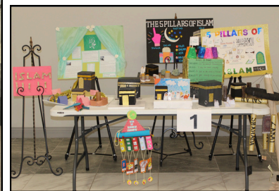
(Above): Elementary projects displayed in last year's Islamic Studies Gallery