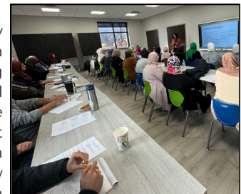
(Above): Staff members attend a Professional Development Training on School Safety.

On Thursday January 16th, the middle & high school building conducted a successful lock-down drill. While these drills are important because they teach students and staff how to react in the case of an emergency, regular drills also allow administration to note and address ways to make our school an even safer place.