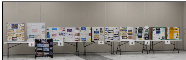
(Above): Student projects featured in last year's Islamic History Gallery

In the elementary building, students are also working on creating visual representations of the 5 Pillars of Islam (amongst other themed projects) that will be featured in the Elementary Islamic Gallery on February 6th. The elementary gallery will also be open to parents throughout the day.