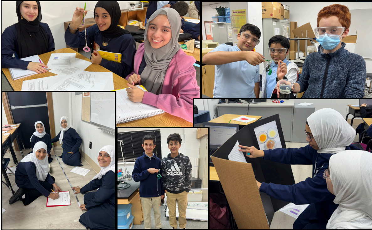
(Top Left): 8th Grade students working on a lab report.