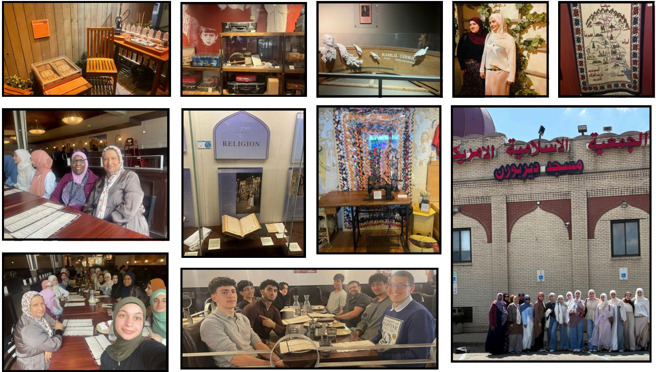
Above: High School Field Trip to Dearborn & The Arab-American Museum